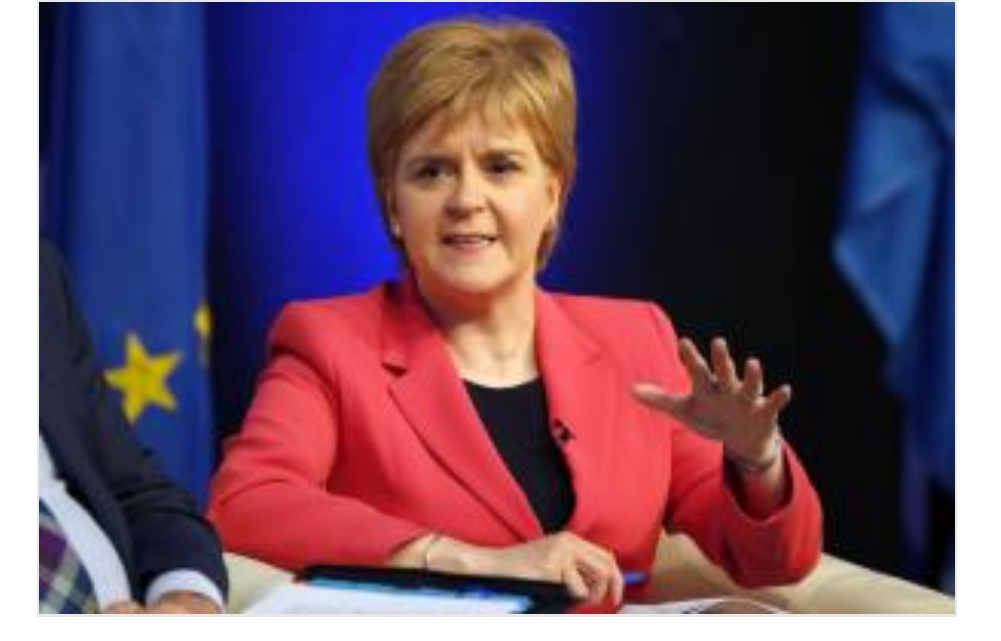
Sturgeon snubs May's offer of a deal to hold indyref2 after Brexit