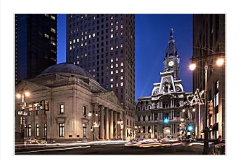
From foodie wows to wedding vows, thanks to the Ladies and