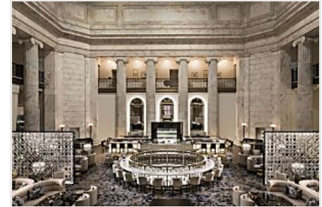
The Ritz Carlton Philadelphia is an architectural