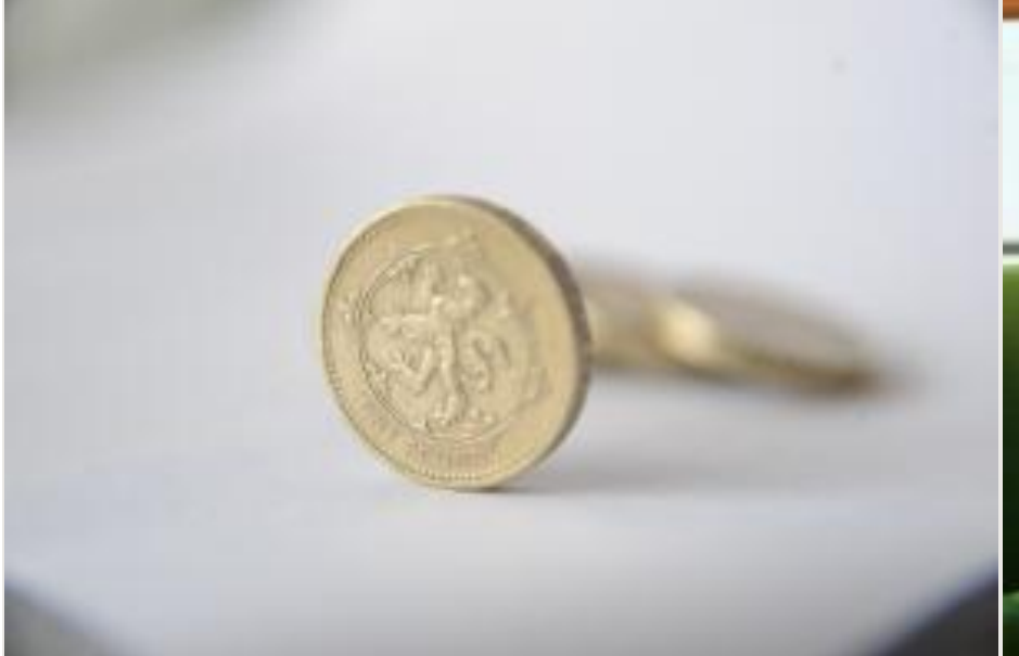
Plan for a new Scottish pound 'likely' to be recommended by SNP Growth Commission, insider says