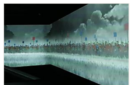
With Technological Synergy, Historical Storytelling Looks