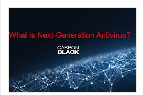
What is Next-Generation Antivirus (NGAV)?