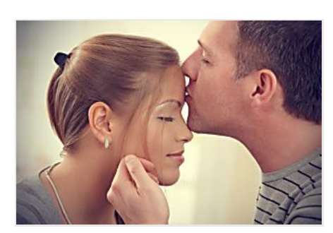
How to Find Real, Lasting Love Without Looking for It