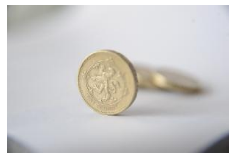
Plan for a new Scottish pound 'likely' to be recommended by SNP Growth Commission, insider says