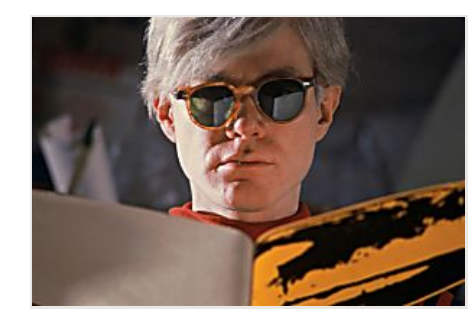
Andy Warhol's Former Art Studio Sells for Nearly $10M